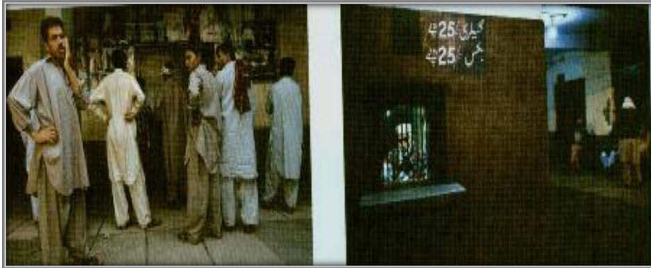
Fig. 2. Traditional Single Screen Theaters Still Exist across Pakistan Catering to the Entertainment Needs of the Poor