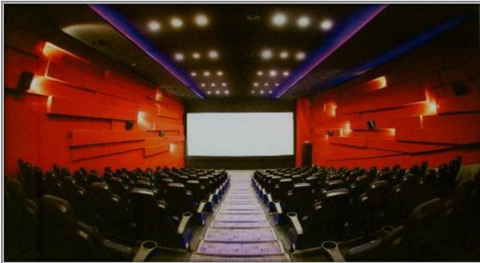
Fig. 3. Inside View of Atrium Karachi Cineplex

Source: Cinema and Society: Film and Social Change in Pakistan edited by Ali Khan and Ali Nobil Ahmad.