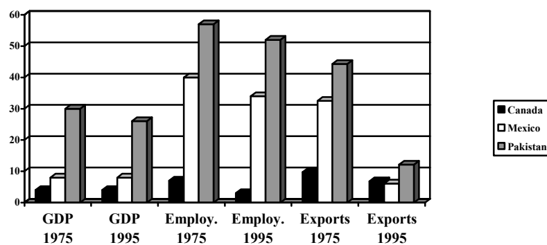
Fig. 1. Agricultural Shares of GDP, Employment, and Exports in 1975 and 1995 for Canada, Mexico, and Pakistan.

3 percent, 34 percent, and 52 percent in 1995. The share of agricultural exports between the two years goes from 9.7 percent to 6.8 percent in Canada, 32.5 percent to 6.1 percent in Mexico, and from 44.3 percent to 12.1 percent in Pakistan. In sum, the data clearly show that agriculture becomes less important in terms of its contribution to GDP, employment, and exports as GNP per capita increases over time for a given country and across countries at a given point in time.