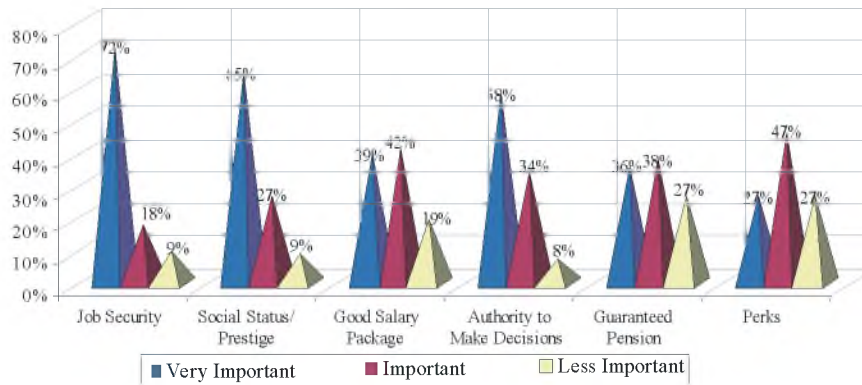
Fig. 3. Factors Influencing Students' Decision to join CSP

Gender-wise responses show that a majority of both male and female students considered 'job security', 'prestige and social status' and 'authority to make decision' as very important factors shaping their preference for the civil service. However, a majority of female students also considered 'good salary package' as a very important factor. 'Perks' were rated as an important factor by both male and female students.