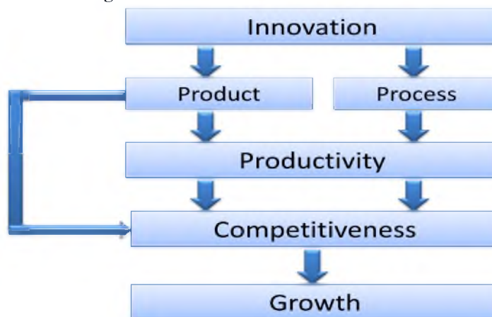
Fig. 1. Innovation as a Driver of Growth