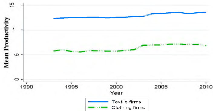
Fig. 1. Mean Productivity of Textile and Clothing Firms—Levinsohn and Petrin Productivity Measure

Figure 1 shows the evolution of mean productivity of the sample of T&C firms used in the paper. It is computed using Levinsohn and Petrin productivity measure (which we explain later in the paper). For the time period under consideration, textile firms have a much higher mean productivity than clothing firms. Furthermore, we notice an upward trend in the mean productivity of both types of firms. The focus of this paper is on the exports of T&C products by Pakistan to the U.S. only. The reason why this is an interesting case to consider is because the United States is the most important trading partner of Pakistan for a sizeable majority of T&C products. In fact, for most of the clothing products exported, the U.S. captures more than 90 percent of total market share. 5 Moreover, the fill rates for nearly all T&C products are very close to one hundred, indicating that quotas imposed by the U.S. were usually binding. 6