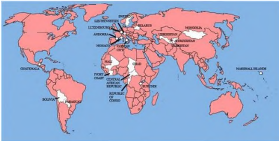
Fig. 2. The Countries that Britain has Invaded