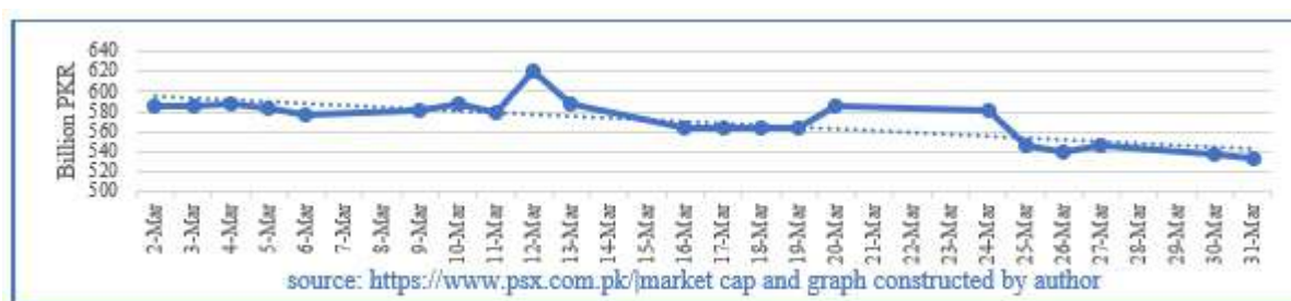
Figure 5: Market capitalization of Tobacco Sector

Table 4 reports that the maximum loss is faced by Philip Morris (Pakistan) Limited (MFFL) with 30.20% decrease in its share price.