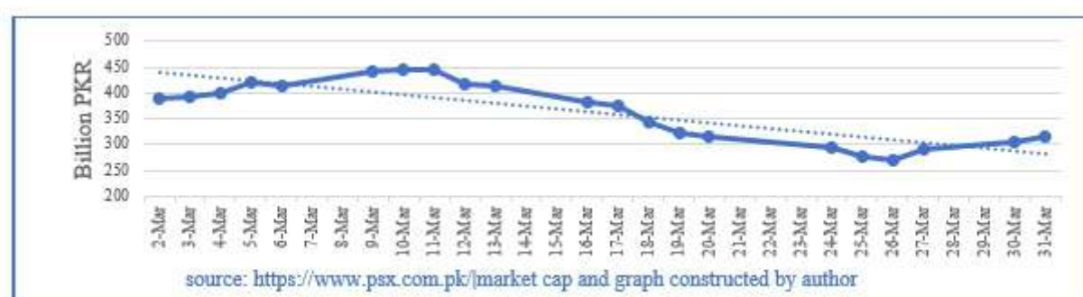
Figure 7: Market capitalization of Cement Sector

Table 6 shows that the maximum loss is faced by Dandot Cement Company Limited (DNCC) with 39% decrease in its share price. COVID 19 has also put lot of stress on cement sector, both on the local and international demand. 80% of our cement is exported to two major importers, Sri Lanka and Bangladesh, and they too are facing lock down situation. Due to reduced demand 11 plants are completely shutdown and remaining 14 plants are in partial shutdown phase.