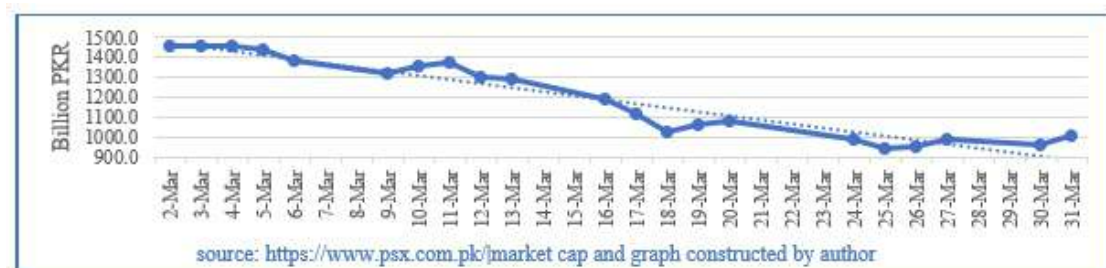
Figure 2: Market Capitalization of Banking Sector

Table 1 reports that United bank limited (UBL) has faced loss of more than 50% decrease in its share price. This decrease in the banking stocks is due to the probability of high future loan losses due to expected economic slowdown in the presence of high interest rates.