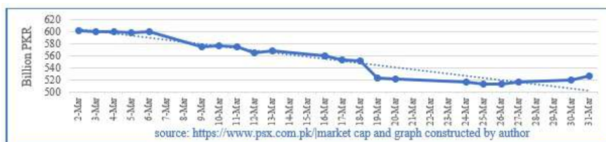
Figure 4: Market Capitalization of Food and Personal Care Products Sector

Table 3 reports that the maximum loss is faced by Mitchells Fruit Farms Limited (MFFL) with 41% decrease in its share price. The declining trend started with the start of the Coronavirus pandemic and prior to lockdown. This implies that it was mainly the reduced demand that led to the decline in stock prices.