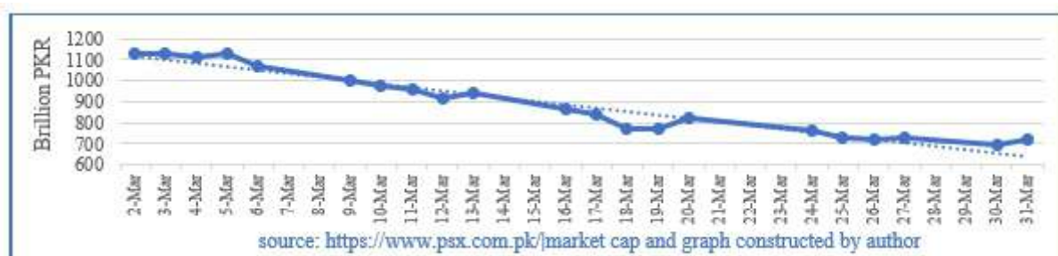
Figure 3: Market capitalization of Oil and Gas Exploration Sector

Table 2 reports that the maximum loss is faced by the Oil and Gas Development Company Limited (OGDCL) with 48.33% decrease in its share price. Energy companies are scrambling to adjust to much lower oil prices brought about by dual shocks to both supply and demand. Due to COVID-19 the country-wide lock down has halted most of the business and decrease the demand of the oil.