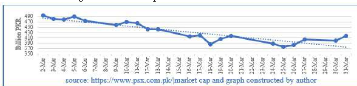
Figure 6: Market capitalization of Fertilizer Sector

Table 5 reports that the maximum loss is faced by Fauji Fertilizer Bin Qasim Limited (FFBL) with 30.20% decrease in its share price. Fertilizer is one of the important components of food supply chain input which the outbreak of COVID has adversely affected. Limitation on the movement of both fertilizers and raw material suppressed both demand and supply for all relevant products reflecting in lowering share prices of these products.