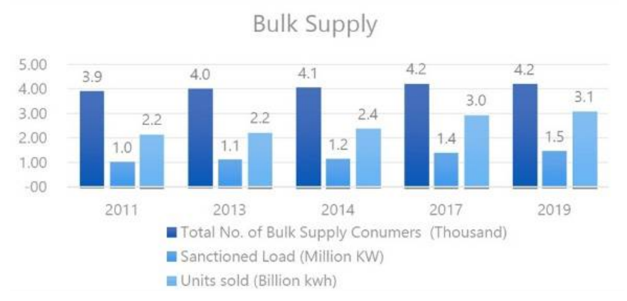
Figure shows that Bulk Supply Consumers have grown by 8% in Pakistan; while consumption has increased from 2.16 billion kWh to 3.09 billion kWh (43% increase). If bilateral contracts become financially unviable owing to excess (above legitimate) wheeling charges to BPCs, the development of competition will be threatened in the long term and export-oriented industries will become non-competitive. Moreover, it will have significant financial impact if costs are recovered from BPCs by DISCOs on Cost of Service which includes irrelevant business costs which are not part of the wire business.