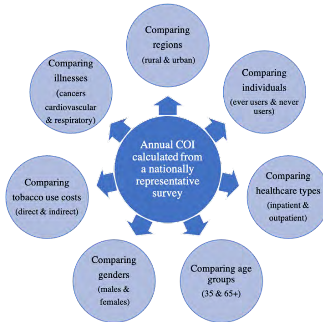
Figure 1. Cost of illness approach

Although these costs are incurred at selected points in time during the cure of smoking-related illnesses, these costs, in fact, accumulate over the years of exposure to tobacco. Hence, this approach is also termed as a prevalence-based approach. This approach is used to calculate the economic costs of smoking of those who (i) are recently diagnosed with or (ii) are in advanced stages of smoking-induced illness, and (iii) those who die of such illnesses in a particular year, irrespective of their smoking initiation or cessation date. Normally a nationally representative sample is required to estimate the cost of tobacco use at various levels of disaggregation, as shown in Figure 1.