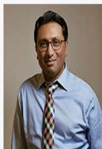
Dr Swarnim Wagle

Extending the debate to Nepal, Dr. Swarnim Wagle asserted that the situation in Nepal is no different than the rest of the region. Initially the number of cases were minimal. The surge in cases is attributed majorly to scale up testing and partly to infiltration through porous borders.