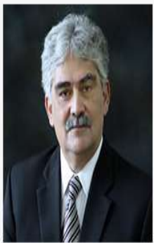
Dr Nadeem Ul Haque

South Asia, the world's most populous region, remains vulnerable to COVID-19. The necessary protection measures are severely impacting economic activity and millions face poverty. Effective Policies are essential to forestall the possibility of worse outcomes, and the necessary measures to reduce contagion and protect lives are an important investment in long-term and economic health. Working together offers the best hope for the region to succeed. This webinar aims to discuss how South Asia can ramp up its response to tackle the pandemic and economic crisis.