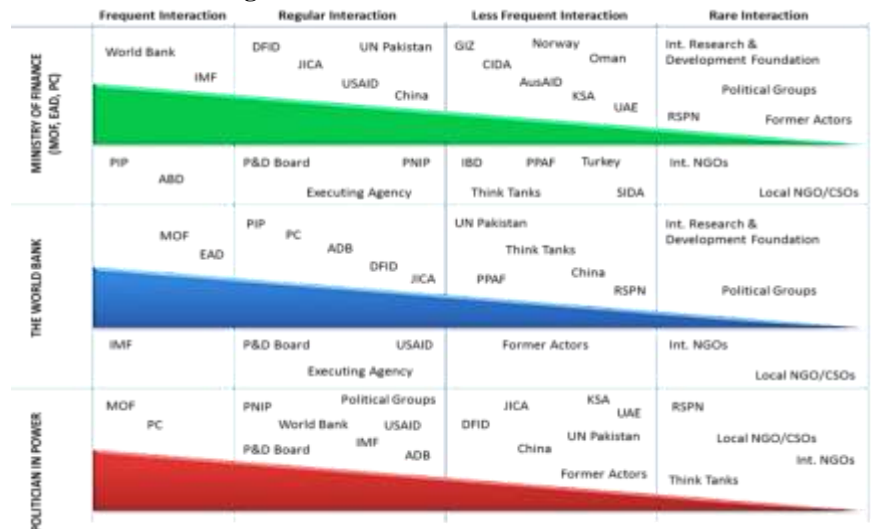
Fig. 3. Patterns of Actors' Interactions

The thickness of bars indicates frequency of interactions that also reflects the level of inclusivity and information transfer between network actors. The findings suggested that the MOF stays in frequent contact with the three large multilateral donors (the World Bank, ADB and IMF) and politicians-in-power; has regular interactions with some large bilateral donors; and concurrently has less frequent or rare interactions with numerous development partners and interest groups. Since aid funds are channelled to the provincial governments through the federal account—due to the balance of payments and sovereign guarantee requirements—the key provincial departments (P&D Board and EA) also stay in regular contact with the federal government.