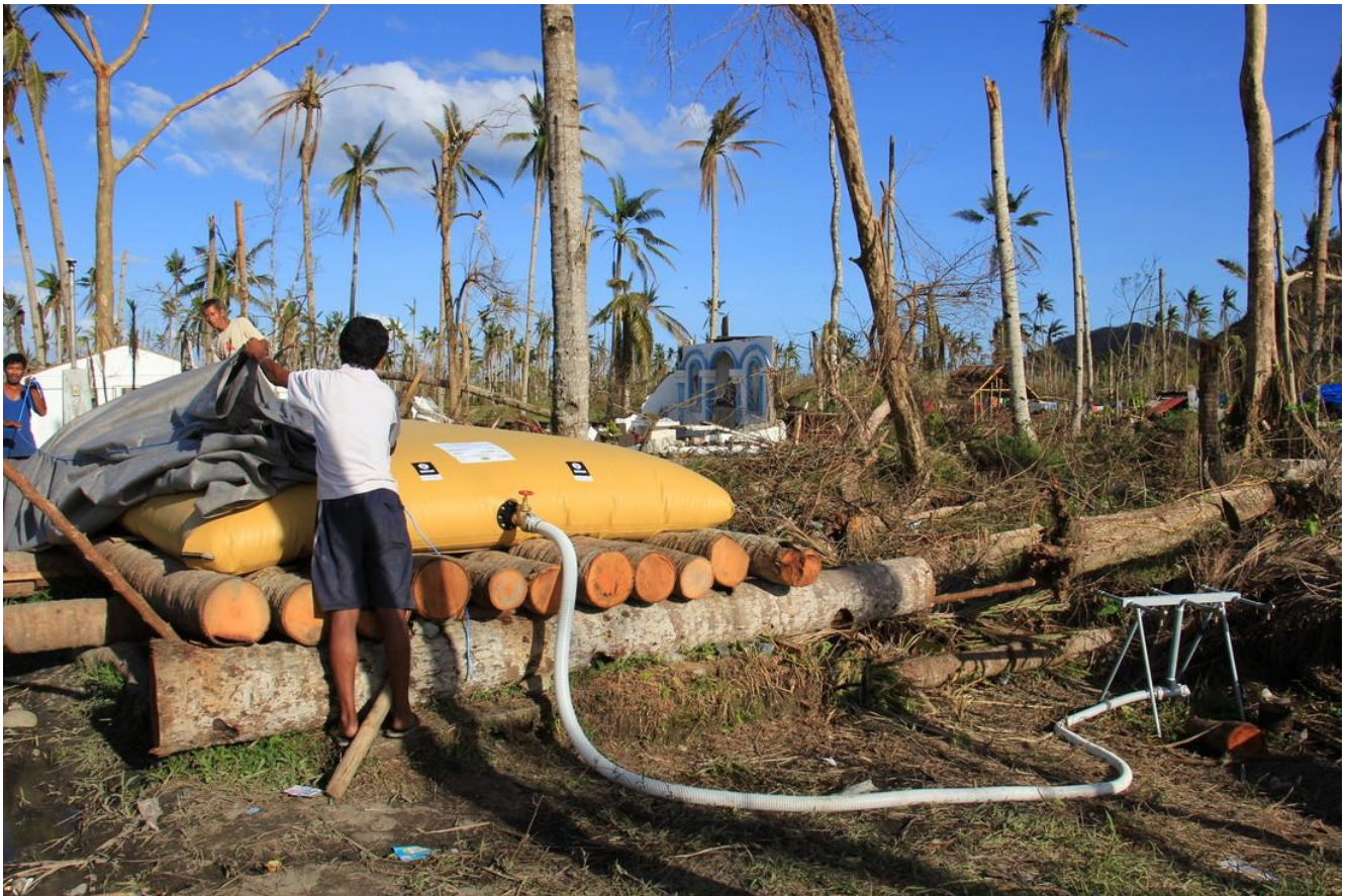
A water tank, filled with 10,000 litres of clean fresh water is installed in Maribi, Leyte (December 2013).