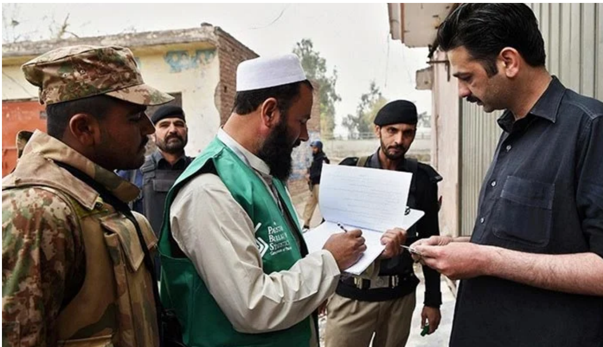
An official from the Pakistan Bureau of Statistics collects information from a resident during a census as security personnel guard them in Peshawar.

ISLAMABAD: Without having the requirement of Computerised National Identity Cards (CNICs) for verification purposes, Pakistan's first-ever digital Population Census will collect data from 185,000 blocks in March 2023 whereby a 40-point questionnaire covering eight important areas' details would be sought.